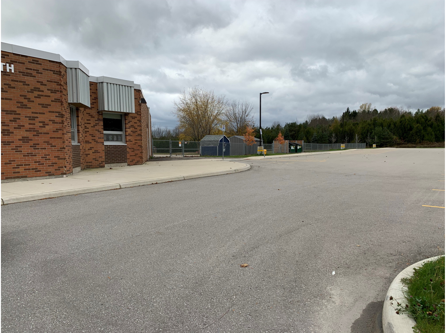
Parking lot at Holland-Chatsworth Central School

Holland-Chatsworth Central School is looking great these days with its enlarged parking lot! Plans are also in the works for asphalt replacement in the playground areas at both Holland-Chatsworth Central and Sullivan Community Schools.